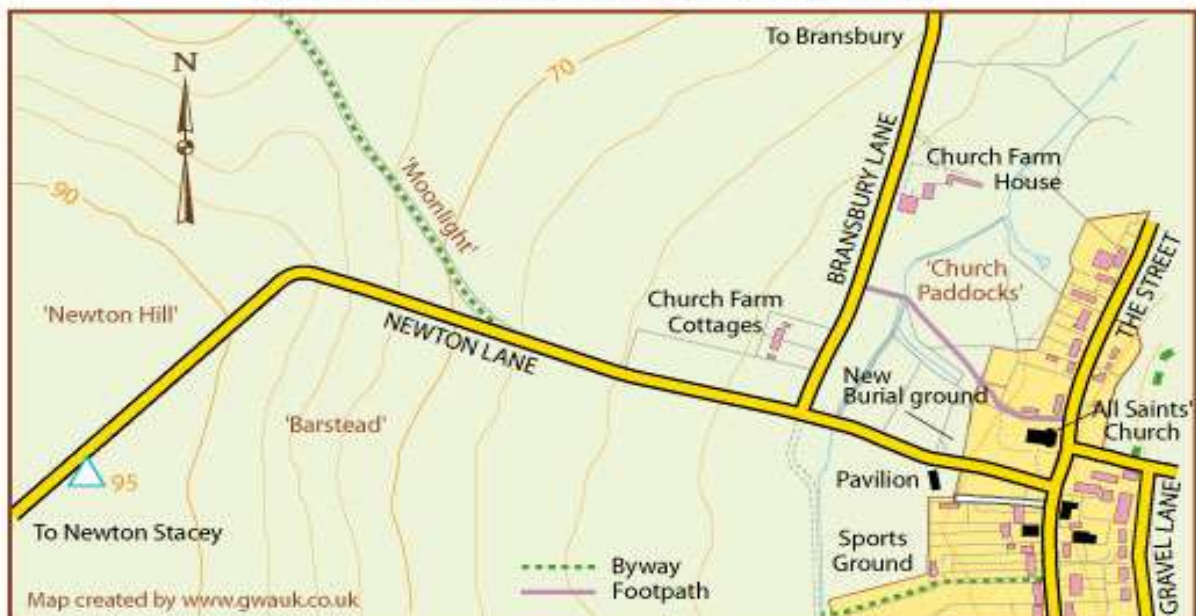
North-western area of Barton Stacey village, circa 2000.