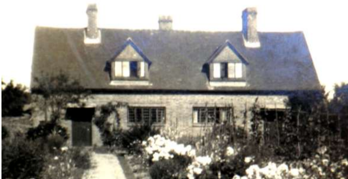
Church Farm Cottages, no.1 on the left, no.2 on the right.