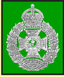
13th Battalion Rifle Brigade (The Prince Consort's Own) Service No. S/1159