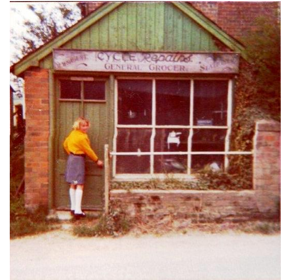
The shop as it appeared in the days when it was a cycle repair shop run by Vic Collins.